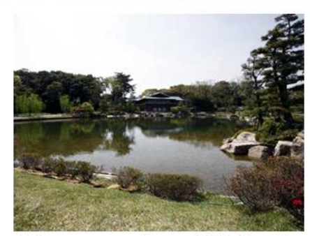
Tokugawaen garden, a distillation of natural Japanese scenery.