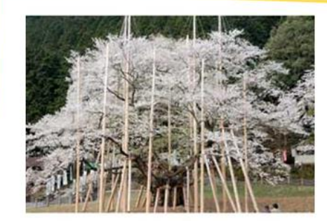
The Usuzumi-zakura in Neodani, Gifu Prefecture. The petals are light pink when the buds appear, white when the flowers are in full bloom, and a light inky color as the petals fall.