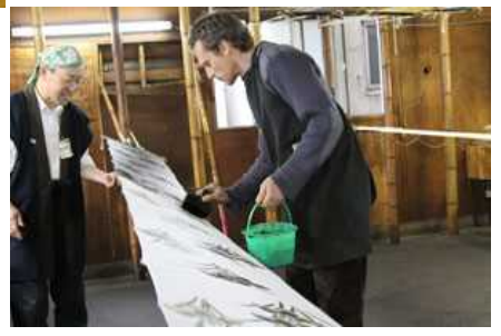
A yuzen atelier in Kyoto welcomes an increasing number of people who come to create their own yukata using an authentic dyeing process.