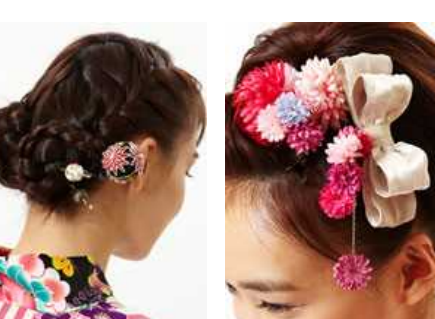
Kanzashi, a traditional Japanese hair ornament, used in a hairstyle done up to look gorgeous.