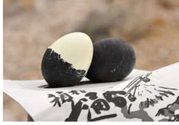
Kurotamago, or "black eggs," an Owakudani Valley specialty