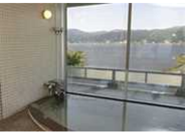
There are even Service Areas with lodging accommodations (Ashigara Service Area) and a hot spring spa (Suwako Service Area, Nagano Prefecture)

No longer simply places for a quick break, Service Areas have undergone a complete transformation into innovative multipurpose facilities.