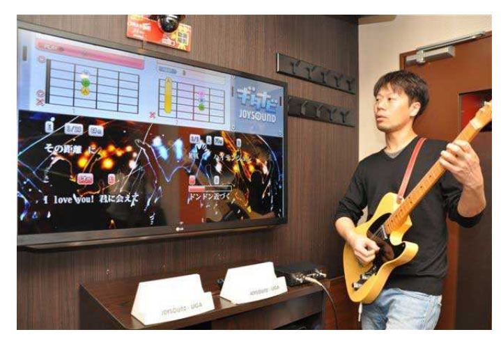
A young man plays guitar as he reads chords on the screen in a karaoke room of Joysound Nakano in Tokyo's Nakano Ward.

In its birthplace of Japan, karaoke is evolving further, with more advanced karaoke machines harnessing web technologies to broaden the scope for fun, including dubbing of anime scenes and singing duets with strangers.