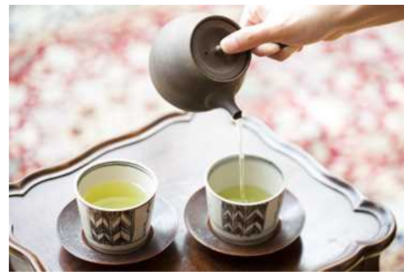
Green tea carefully brewed in a small teapot

Around the world, Japanese green tea has been acclaimed as one of the healthiest drinks available, but few people know much about its ancient origins, varieties and popularity throughout present-day Japan.