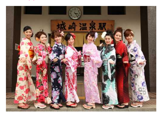
Candidates for "Miss Yukata" 2012 in colorful yukata at Kinosaki Onsen, Hyogo Prefecture.

Yukata is one of traditional garments for summer in Japan. Especially popular among women, yukata with modern and colorful designs have made their appearance in addition to traditional ones in recent years.