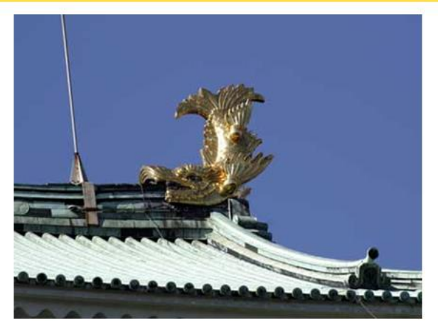
The golden shachihoko are the symbol of Nagoya Castle.

Nagoya, the largest city in the Chubu region of central Honshu, got its start as a castle town in 1610. It has continued to grow and develop ever since, holding on to its rich samurai past while growing into one of the world's leading centers of the automobile industry.