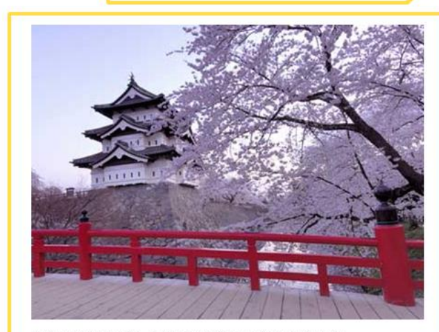
Hirosaki Castle in the northeast of Japan is surrounded by some 2,600 cherry trees.