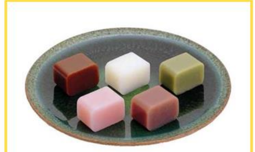
Nagoya's colorful uiro come in a variety of flavors, including azuki beans and matcha green tea.

Nagoya, the largest city in the Chubu region of central Honshu, got its start as a castle town in 1610. It has continued to grow and develop ever since, holding on to its rich samurai past while growing into one of the world's leading centers of the automobile industry.