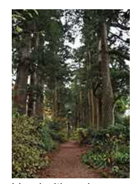
Lined with cedar trees, the old Tokaido Road offers a glimpse of the Edo era.