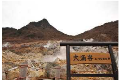
In Owakudani Valley, hot vapor continues to spout from the ground after a volcanic eruption 3,000 years ago.