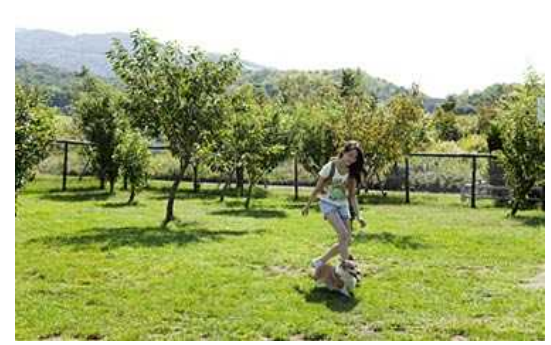
The spacious dog run at Usuzan Service Area, Hokkaido