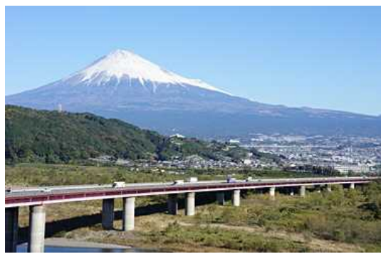
Beautiful Mt. Fuji vista seen from Fujikawa Service Area in Shizuoka Prefecture