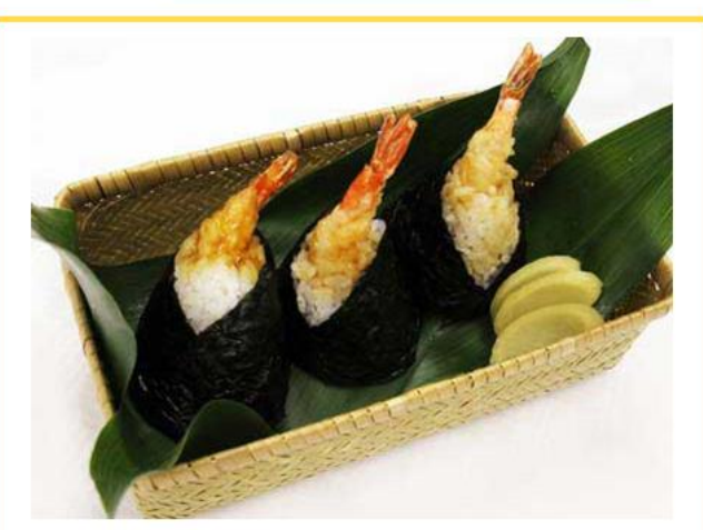
The ten-musu —a rice ball containing a tempura shrimp.