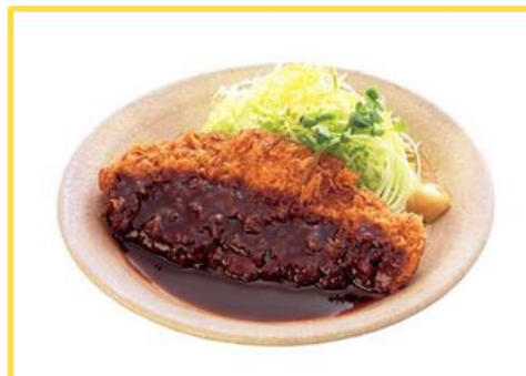
Miso katsu, a pork cutlet topped with a sweet miso-flavored sauce.