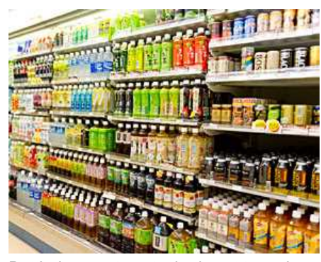
Bottled green tea stocked next to sodas and sports drinks on convenience store shelves