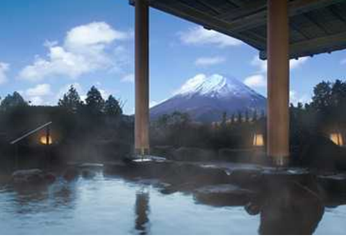
An open-air spa at Sengokuhara, one of the "17 hot springs of Hakone," with a view of Mt. Fuji.