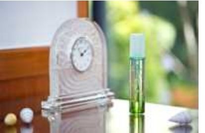
Simple glamour of eau de parfum with the refreshing fragrance of green tea