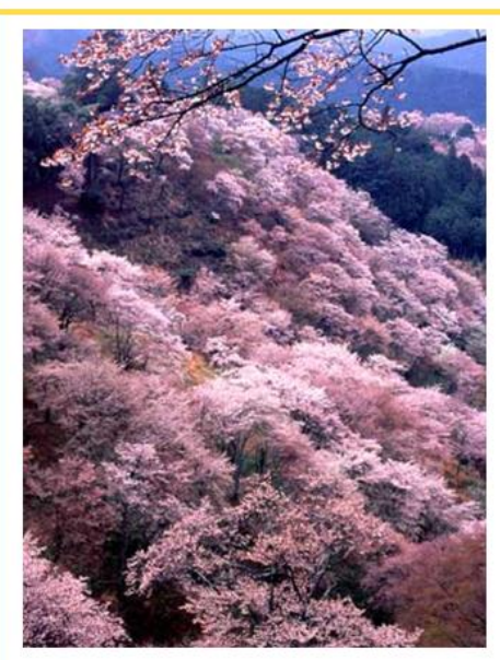
Around 30,000 cherry trees come into bloom every spring at Mt. Yoshino in Nara Prefecture, which has been inscribed on the UNESCO World Heritage Site.

Blossoming cherry trees ( sakura ) have held a special place in Japanese people's hearts for centuries. Famous cherry-blossom spots around the country include mountain spots where cherry trees grow wild, historic temples and castles, and parks.