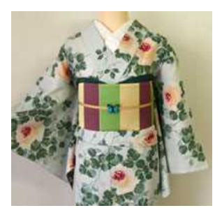
Putting on an unobtrusive obidome, an obi accessory, gives an accent to the outfit.

Right: A pink-tone yukata coordinated with a pale green obi with a floral pattern creates a casual atmosphere. A drawstring bag with a basket base is good for summer.