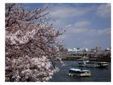
A boat trip down Sumida River is a great way to enjoy the cherry trees that were first planted along its banks back in the Edo Period.