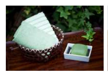
Towel dyed with antibacterial, odor-resistant catechin and soap with green tea extract, known for its moisturizing properties

Around the world, Japanese green tea has been acclaimed as one of the healthiest drinks available, but few people know much about its ancient origins, varieties and popularity throughout present-day Japan.