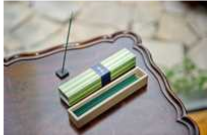
Incense made of green tea-a sniff of the fragrance of green tea soothes the Japanese soul